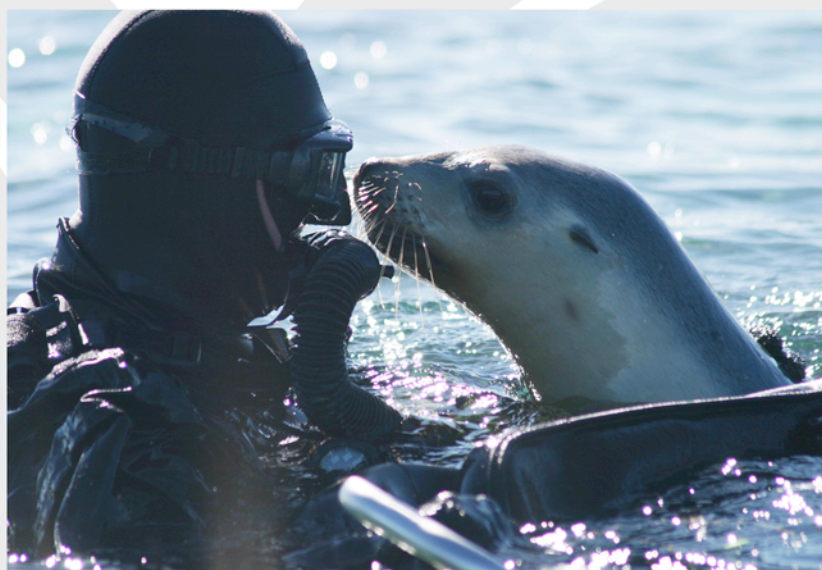
CASTORO C96 PRO È CERTIFICATO CE CASTORO C96 PRO IS CE CERTIFIED